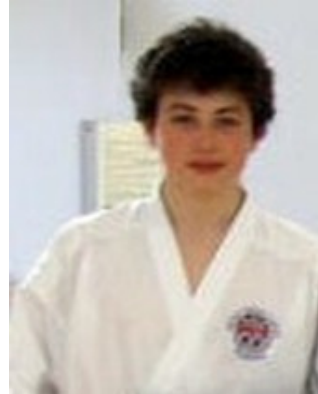
Assistant Instructor to the Zanshin Karate Club, Burgess Hill, Sussex.