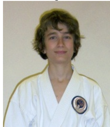
Assistant Instructor to the Plymouth Schools of Karate, Devon.