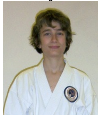
Assistant Instructor to the Pomphlett Karate Club, Devon.