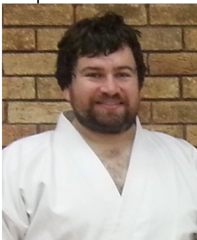
Assistant Instructor of East West Wado Karate, Newcastle, Tyne & Wear. Examiner Level 2.