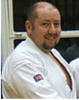
Senior Technical Advisor to the Zanshin Karate Club, Burgess Hill, Sussex.