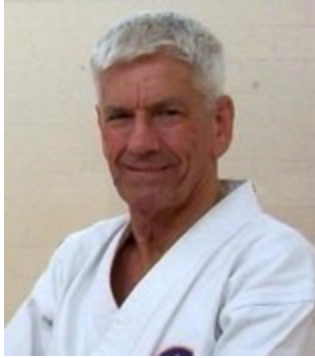
Senior Instructor of the Kingslea School Horsham Wado Karate Club, Sussex. Examiner Level 3/4f.