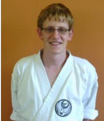
Instructor to the Grey Wolf Wadoryu Karate Club, Cirencester, Gloucestershire. Examiner Level 2.