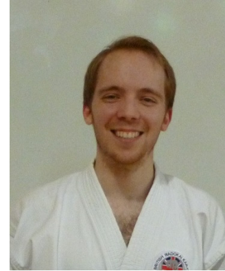
Senior Instructor to Zanshin Karate Club, Burgess Hill, Sussex. Examiner Level 3/4b.