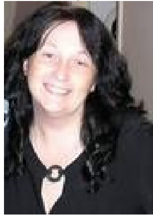
Senior Academia Assessor