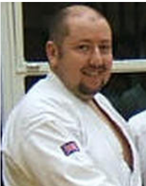
Senior Technical Advisor to the Zanshin Karate Club, Burgess Hill, Sussex.