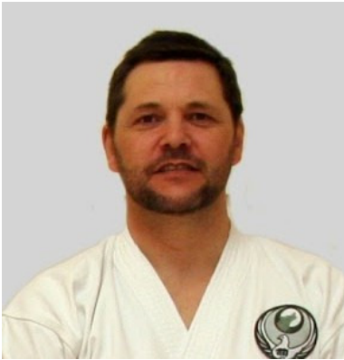
Assistant Instructor to the Grey Wolf Wadoryu Karate Club, Cirencester, Gloucestershire. Examiner Level 3.