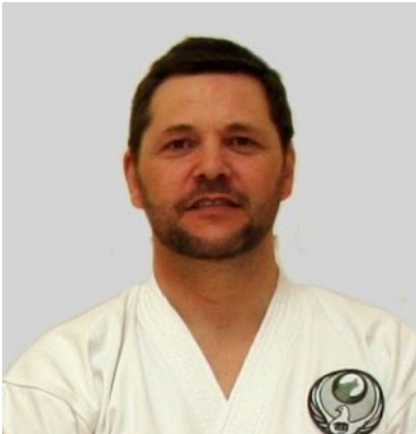
Assistant Instructor to the Grey Wolf Wadoryu Karate Club, Cirencester, Gloucestershire. Examiner Level 3.