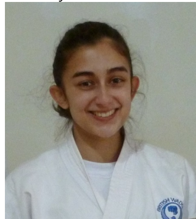
Assistant Instructor to the University of Plymouth Wadoryu Karate Club. Examiner Level 1.