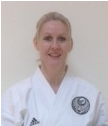
Assistant Instructor to the Grey Wolf Wadoryu Karate Club, Cirencester, Gloucestershire. Examiner Level 2.