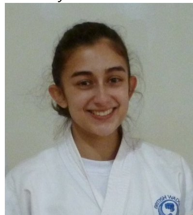
Assistant Instructor to the University of