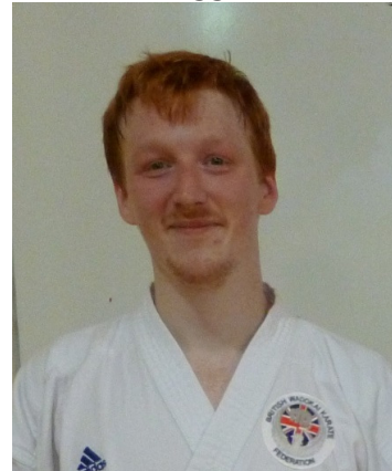
Instructor to the University of Plymouth Wadoryu Karate Club. Examiner Level 2.