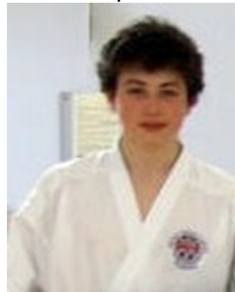
Assistant Instructor to the Zanshin Karate Club, Burgess Hill, Sussex.