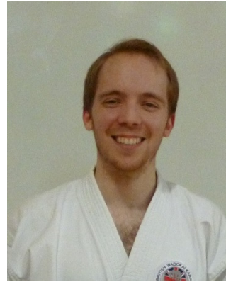
Senior Instructor to Zanshin Karate Club, Burgess Hill, Sussex. Examiner Level 3/4b.