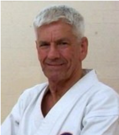
Director of Academia & Assessment