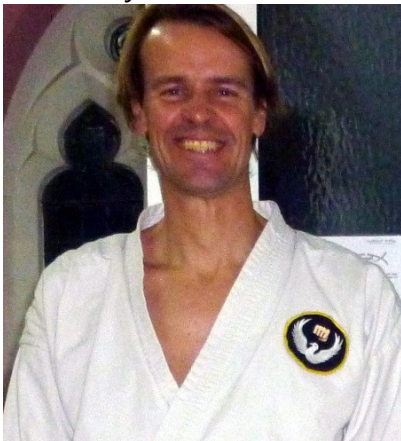
Assistant Instructor to the Pomphlett Karate