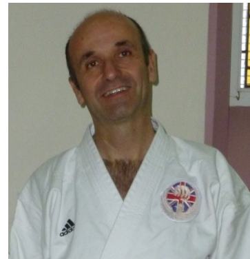
Assistant Instructor & Examiner for Plymouth Schools of Karate. Examiner Level 3/4c