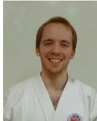
Senior Instructor to Zanshin Karate Club, Burgess Hill, Sussex. Examiner Level 3/4b.