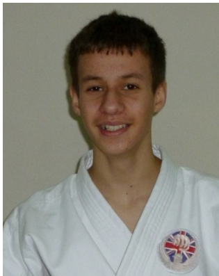
Assistant Instructor to the Plymouth Schools of Karate, Devon. Examiner Level 2.