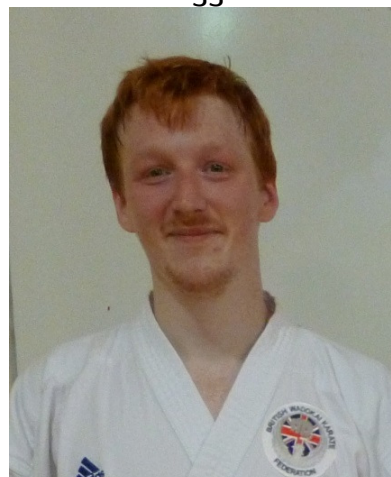
Instructor to the University of Plymouth Wadoryu Karate Club. Examiner Level 2.