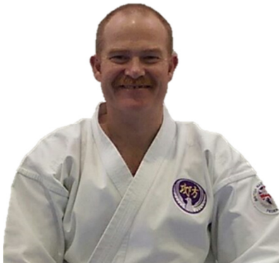
Senior Instructor to the Ko-Bo Wadoryu Karate Club, Shrivenham, Oxfordshire. Examiner Level 3/4b.