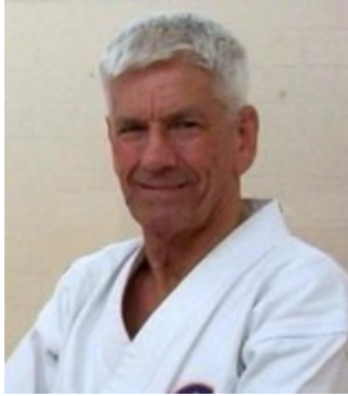
Senior Instructor of the Kingslea School Horsham Wado Karate Club, Sussex. Examiner Level 3/4f. Director of Academia & Assessment