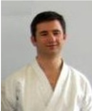
Senior Instructor and Assistant Instructor to the Cranleigh Karate Club, Surrey. Examiner Level 3/4d.