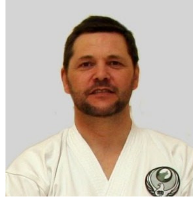
Assistant Instructor to the Grey Wolf Wadoryu Karate Club, Cirencester, Gloucestershire. Examiner Level 3/4b.