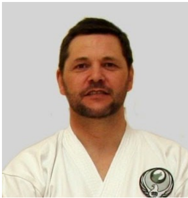
Assistant Instructor to the Grey Wolf Wadoryu Karate Club, Cirencester, Gloucestershire. Examiner Level 3.