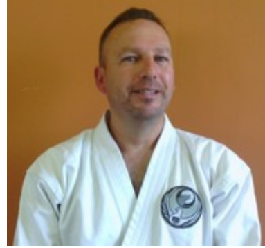
Senior Instructor to the Grey Wolf Wadoryu Karate Club, Cirencester, Gloucestershire. Examiner Level 3/4e. Academia Assessor.