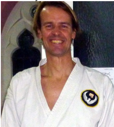
Assistant Instructor to the Plymouth Schools of Karate, Devon. Examiner Level 1.