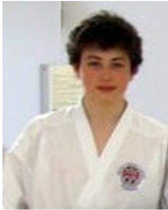
Assistant Instructor to the Zanshin Karate Club, Burgess Hill, Sussex.