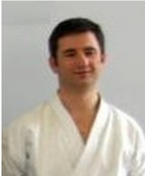
Senior Instructor and Assistant Instructor to the Cranleigh Karate Club, Surrey. Examiner Level 3/4d.