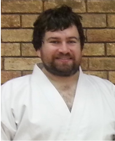
Assistant Instructor of East West Wado Karate, Newcastle, Tyne & Wear. Examiner Level 2.