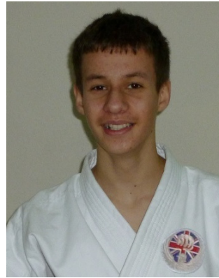
Assistant Instructor to the Plymouth Schools of Karate, Devon. Examiner Level 2.