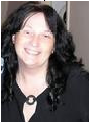
Academia Assessor (Yūdan Written Examination Assessor).