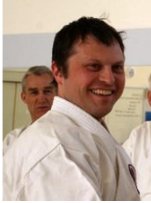
Instructor to the University of Plymouth Wadoryu Karate Club. Examiner Level 3/4c.