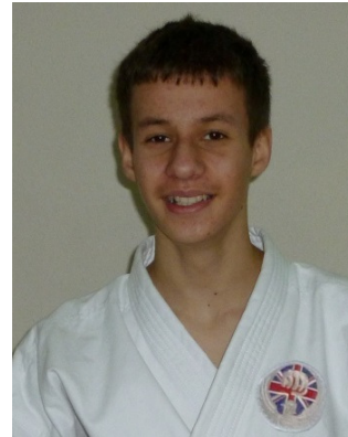
Assistant Instructor to the Gunnislake Karate Club, Cornwall and the Pomphlett Karate Club, Devon. Examiner Level 2.