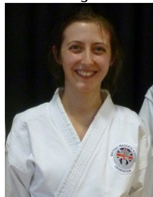
Assistant Instructor of East West Wado Karate, Newcastle, Tyne & Wear.