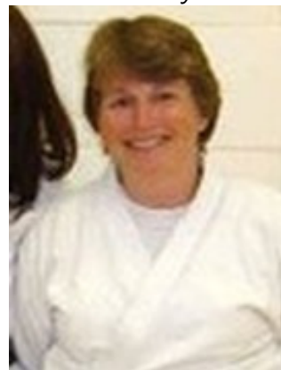
Assistant Instructor to the Cranleigh Karate Club and Cranleigh School Karate Club, Surrey.