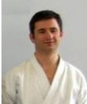
Senior Instructor and Assistant Instructor to the Cranleigh Karate Club, Surrey. Examiner Level 3/4d.