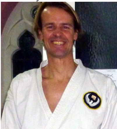
Assistant Instructor to the Plymouth Schools