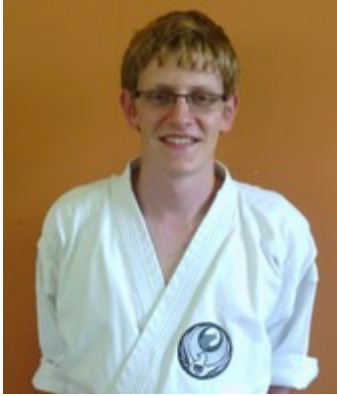
Instructor to the Grey Wolf Wadoryu Karate Club, Cirencester, Gloucestershire. Examiner Level 2.