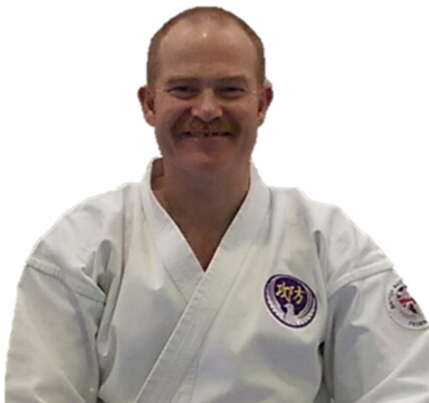
Senior Instructor to the Ko-Bo Wadoryu Karate Club, Shrivenham, Oxfordshire. Examiner Level 3/4b.