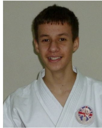
Assistant Instructor to the Gunnislake Karate Club, Cornwall and the Pomphlett Karate Club, Devon. Examiner Level 2.