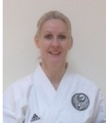
Assistant Instructor to the Grey Wolf Wadoryu Karate Club, Cirencester, Gloucestershire. Examiner Level 2.