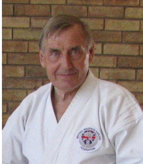
Senior Instructor of the Hartlepool Wadoryu Karate Club, Hartlepool, Durham. Examiner Level 3/4e.