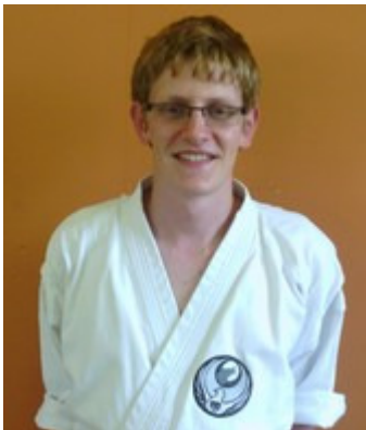
Instructor to the Grey Wolf Wadoryu Karate Club, Cirencester, Gloucestershire. Examiner Level 2.