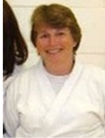
Assistant Instructor to the Cranleigh Karate Club and Cranleigh School Karate Club, Surrey.