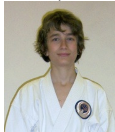
Assistant Instructor to the Pomphlett Karate Club, Devon.