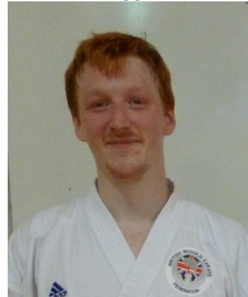
Instructor to the University of Plymouth Wadoryu Karate Club. Examiner Level 2.