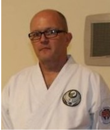
Assistant Instructor to the Grey Wolf Wadoryu Karate Club, Cirencester, Gloucestershire. Examiner Level 3/4b.