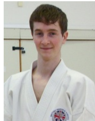
Instructor to Zanshin Karate Club, Burgess Hill, Sussex. Examiner Level 2.