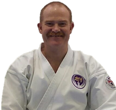
Senior Instructor to the Ko-Bo Wadoryu Karate Club, Shrivenham, Oxfordshire. Examiner Level 3/4b.