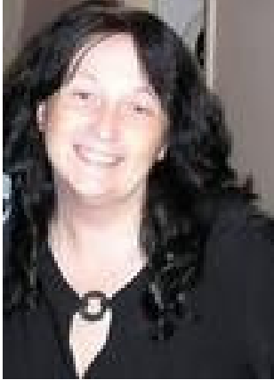
Senior Academia Assessor (Yūdan Written Examiner Assessor).