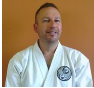
Senior Instructor to the Grey Wolf Wadoryu Karate Club, Cirencester, Gloucestershire. Examiner Level 3/4e.