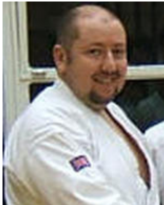
Senior Technical Advisor to the Zanshin Karate Club, Burgess Hill, Sussex.