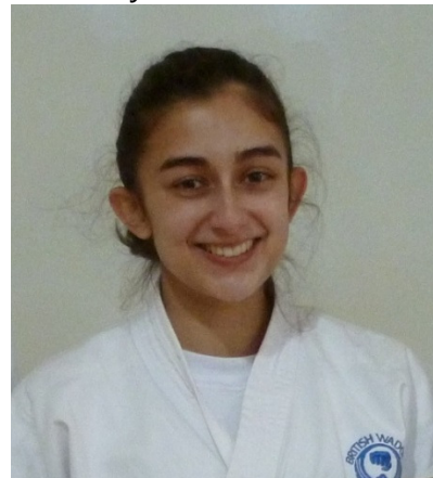
Assistant Instructor to the University of