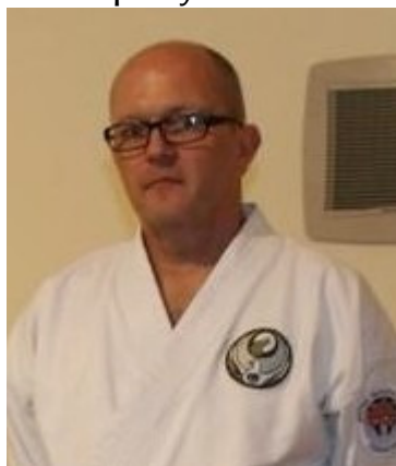
Assistant Instructor to the Grey Wolf Wadoryu Karate Club, Cirencester, Gloucestershire. Examiner Level 3.