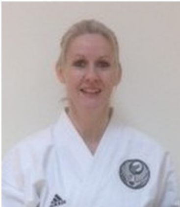
Assistant Instructor to the Grey Wolf Wadoryu Karate Club, Cirencester, Gloucestershire. Examiner Level 2.