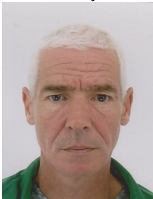
Assistant Instructor to Tozai Wado Karate, Newcastle, Tyne & Wear.