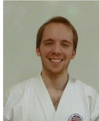
Senior Instructor to Zanshin Karate Club, Burgess Hill, Sussex. Examiner Level 3/4b.