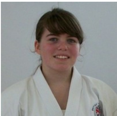
Assistant Instructor to the Zanshin Karate Club, Burgess Hill, and Kingslea School