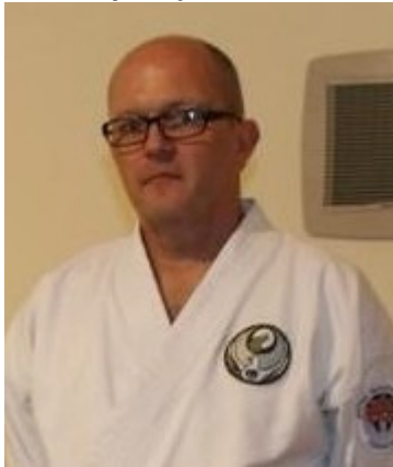
Assistant Instructor to the Grey Wolf Wadoryu Karate Club, Cirencester, Gloucestershire. Examiner Level 3.