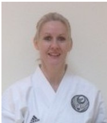
Assistant Instructor to the Grey Wolf Wadoryu Karate Club, Cirencester, Gloucestershire. Examiner Level 2.