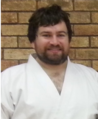
Assistant Instructor of East West Wado Karate, Newcastle, Tyne & Wear. Examiner Level 2.