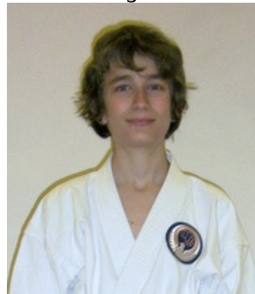
Assistant Instructor to the Plymouth Schools of Karate, Devon.