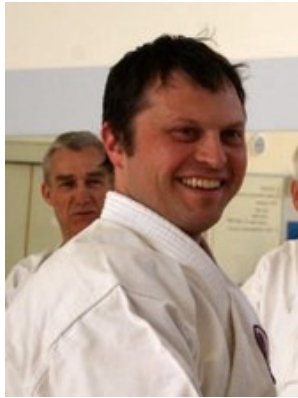
Instructor to the Plymouth Schools of Karate, Devon. Examiner Level 3/4c.