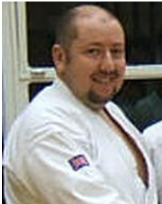
Senior Technical Advisor to the Zanshin Karate Club, Burgess Hill, Sussex.